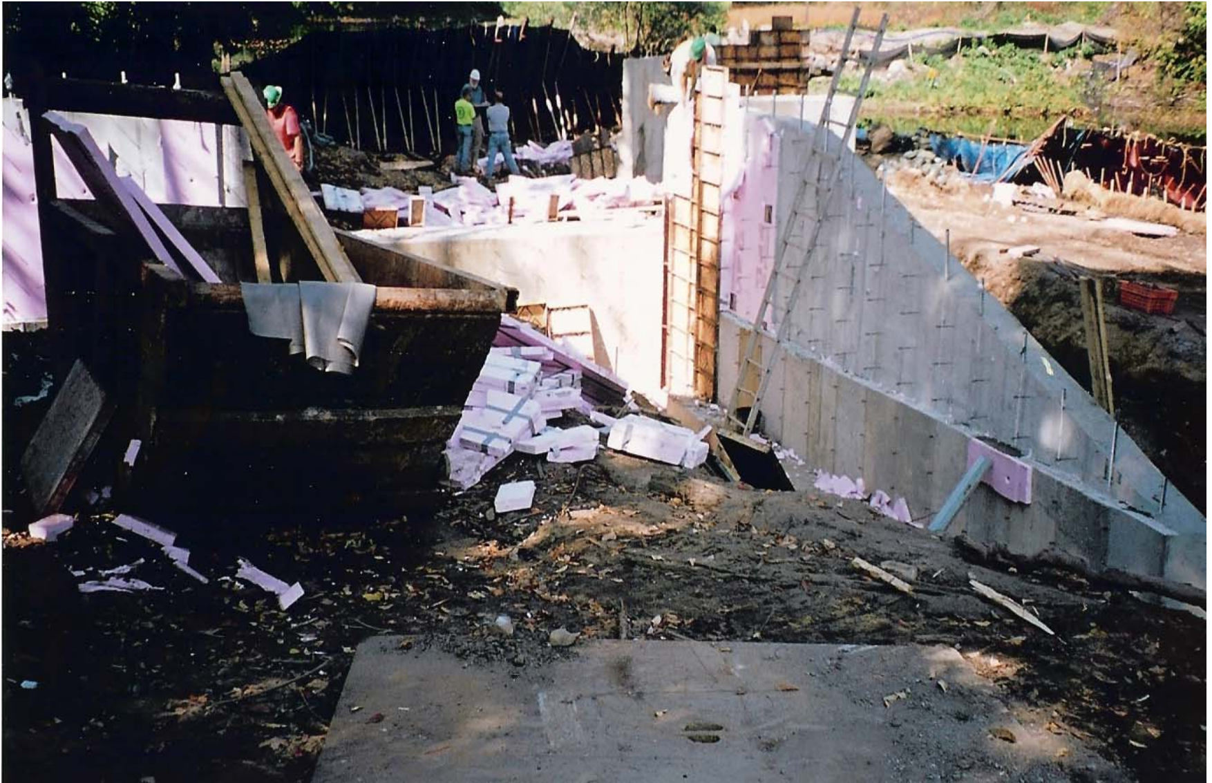
The Walls of the Sluiceway have been poured in stages.