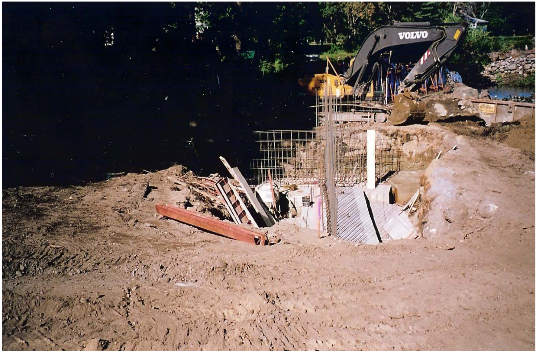
Preparing the Footings on the New Sluiceway