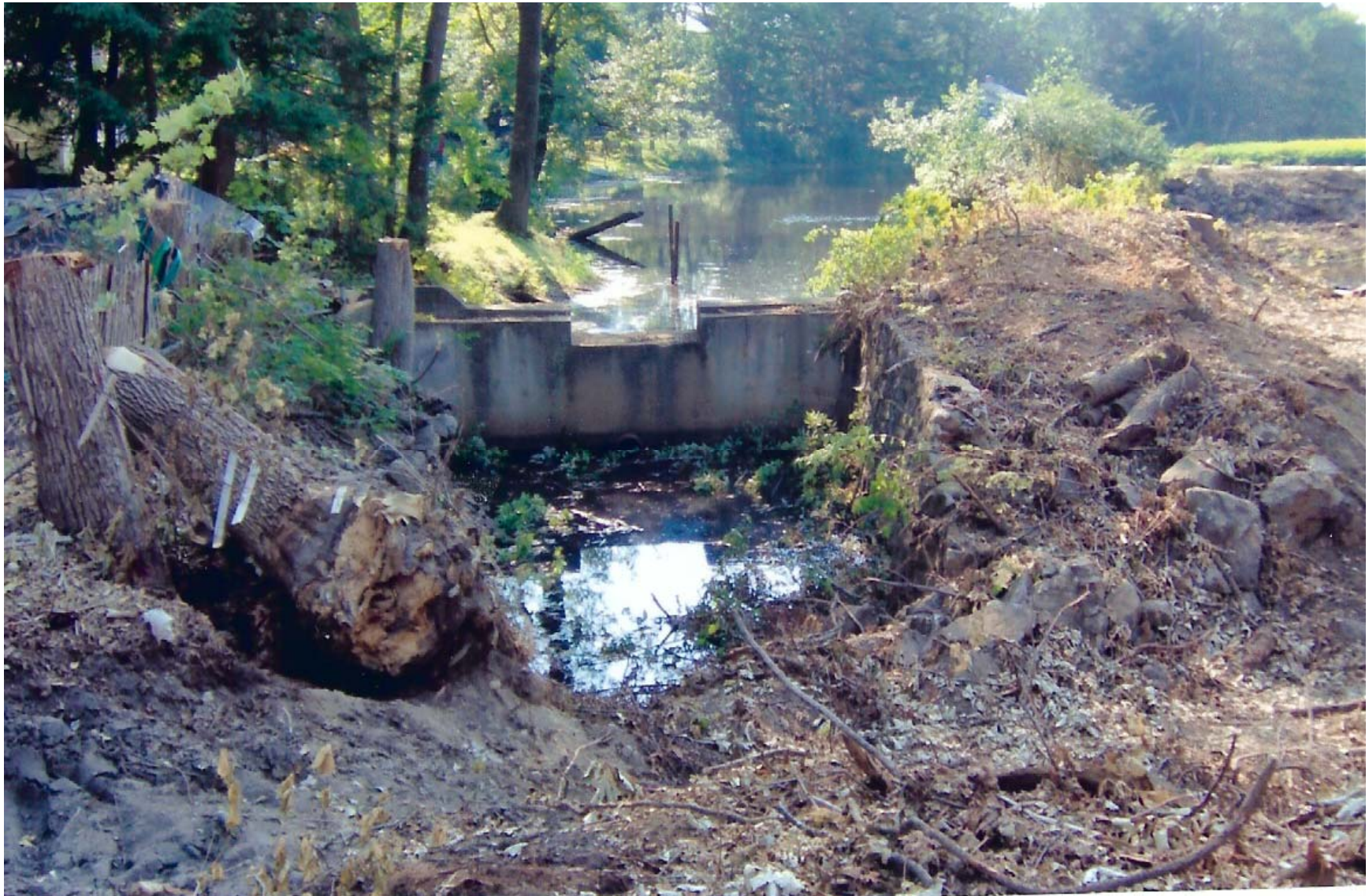
Sluiceway is Cleared in Preparation of setting of the Cofferd Dam