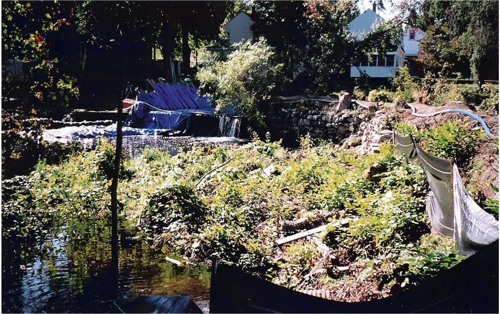
Redirecting Water Away from Sluiceway into Main Stream Using Cofferd Dam in Background