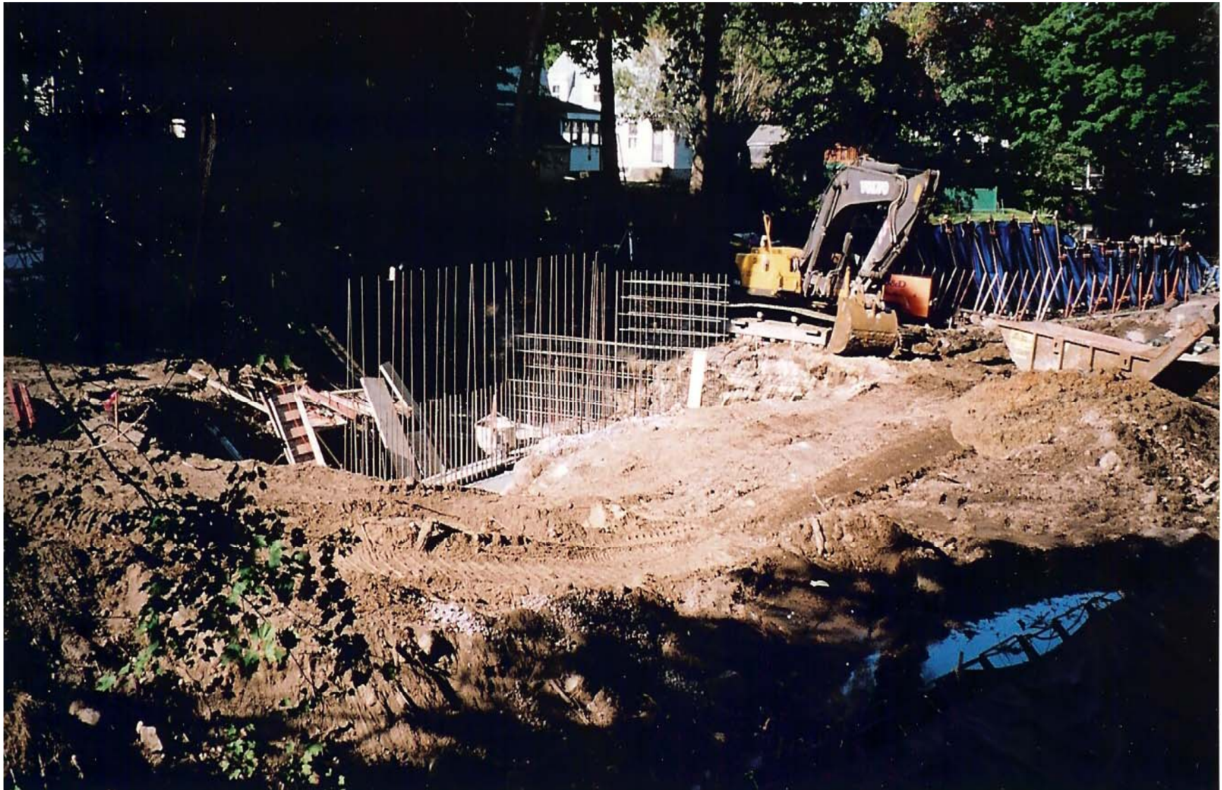
The Framework for the Sides of the Sluiceway Have Begun