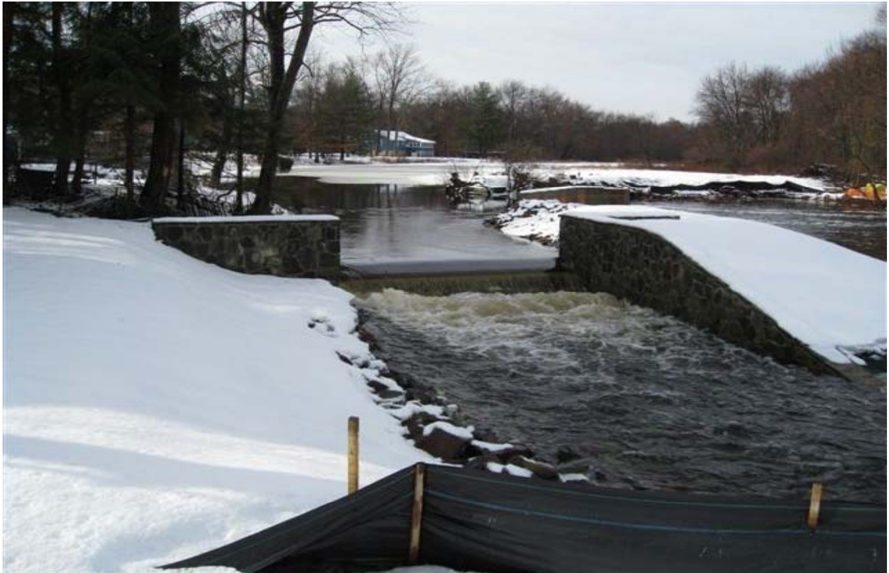
The Sluiceway Wearing a Winter Coat Waiting for Spring