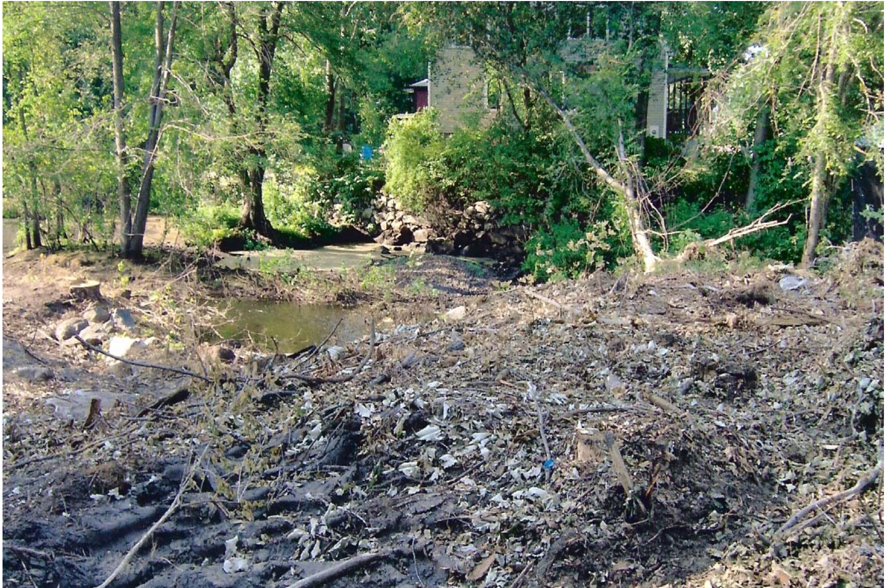
Cleared Area Near Auxiliary Sluiceway