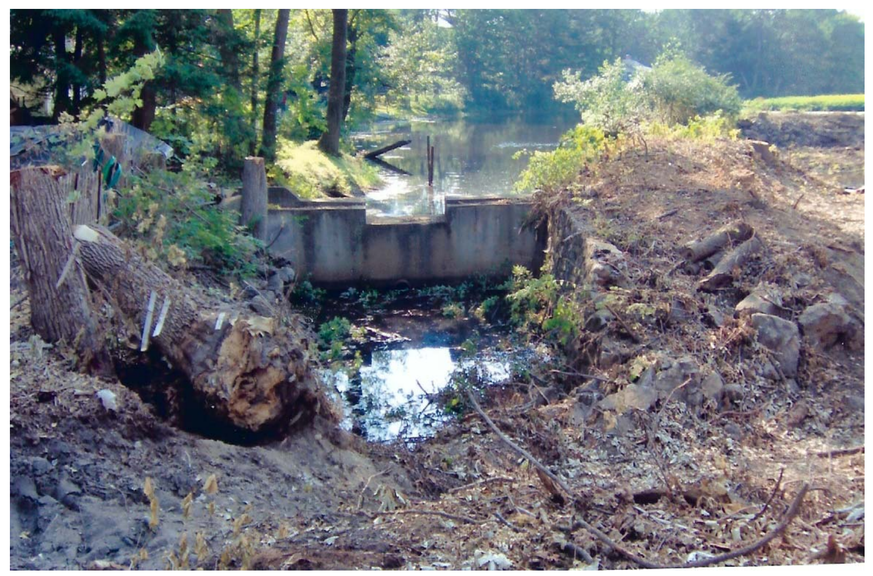
Spillway is cleared in preparation of installation of the Cofferdam